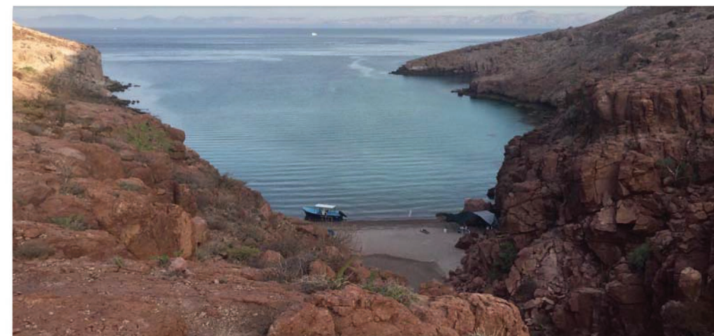
ROC - Mexico Park Service Base Camp on Espiritu Santo

In 2018, ROC traveled over 23,000 km and spent over 3,000 hours on the water in the Bay of La Paz. Since April 2018 no illegal fishing has been encountered. By comparison in 2017, 13 illegal boats were confiscated.